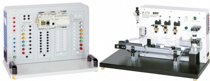
Figure 1: PLC Trainer (left) & Automation System (right)[1]