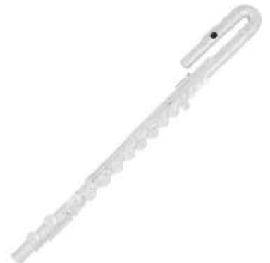
Figure 1: Trevor James Silver Plated Alto Flute from: https://tjflutes.com/products/alto/performerseries/tjsilveraltoflutes

Woodwind Methods, designed for k-12 instrumental majors, and Instrumental Methods, for the k-12 vocal majors, are essential courses in the music education degree plan. Flute Choir, open to anyone who can play the flute, offers students a chamber music ensemble containing instruments in the flute family. This course is open to any major at both the undergraduate and graduate level. This year, the Flute Choir will be traveling to San Antonio, TX in August to represent Mississippi State University in a recital performance at the National Flute Association Annual Convention. Applied Flute is designed for music performance, music education, and non-majors to dedicate a deeper study of the instrument through one-on-one instruction. With the addition of an alto flute, all the courses above would benefit greatly in lesson planning, execution of course materials, performance opportunities, creative research endeavors, and overall knowledge of the instrument family.