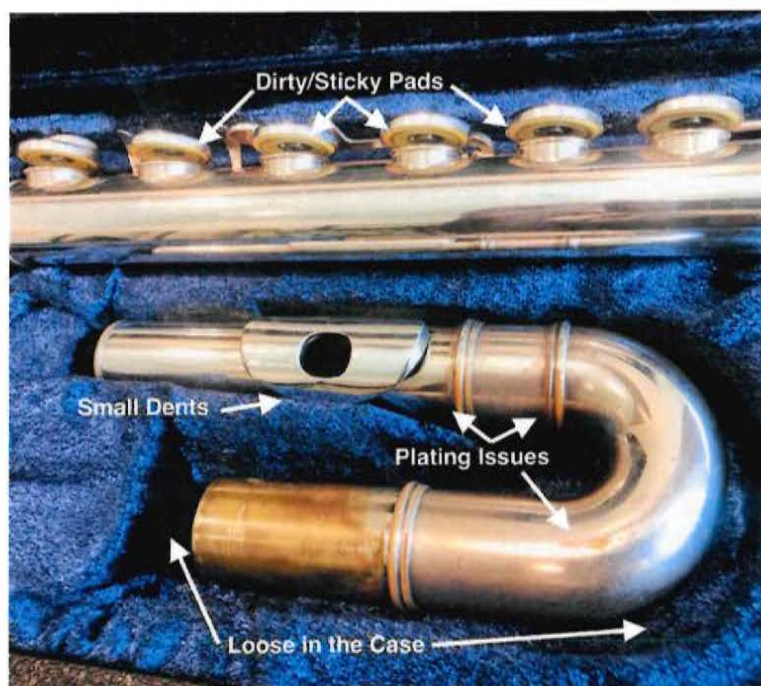
Figure 2: Current MSU Alto Flute

Unfortunately, the Department of Music only owns one alto flute which is in desperate need of repair. According to department records, the current instrument was acquired in 1990. It has a broken case, several sticky/dirty pads, plating issues, small dent, and key mechanism issues. With the addition of a second alto flute, more students will be introduced to the instrument and have the chance to learn, practice, and perform on it for performance activities, classroom lesson plans, and creative research engagements. As our Music Department continues to grow, we are in need of a quality instrument to use in classes and ensembles.